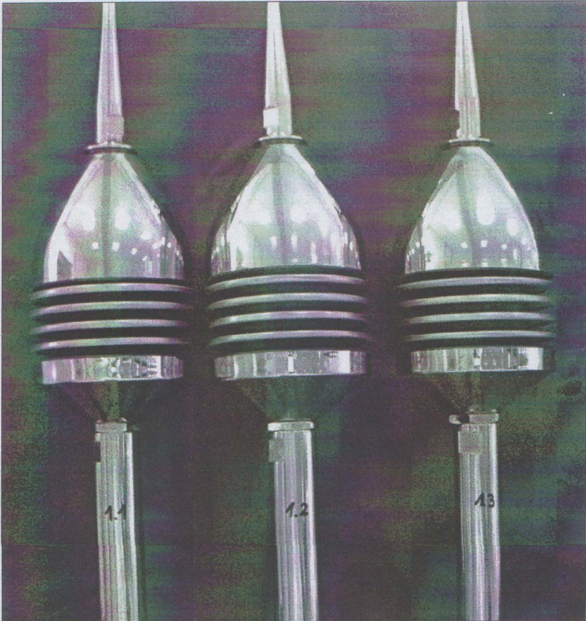
Figure 2: DUT after the impulse current test